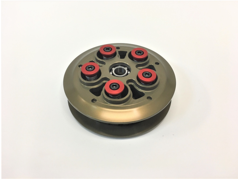
Slipper clutch for motorbike KAWASAKI NINJA 400 RS