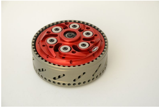
Slipper clutch for motorbike DUCATI 48T