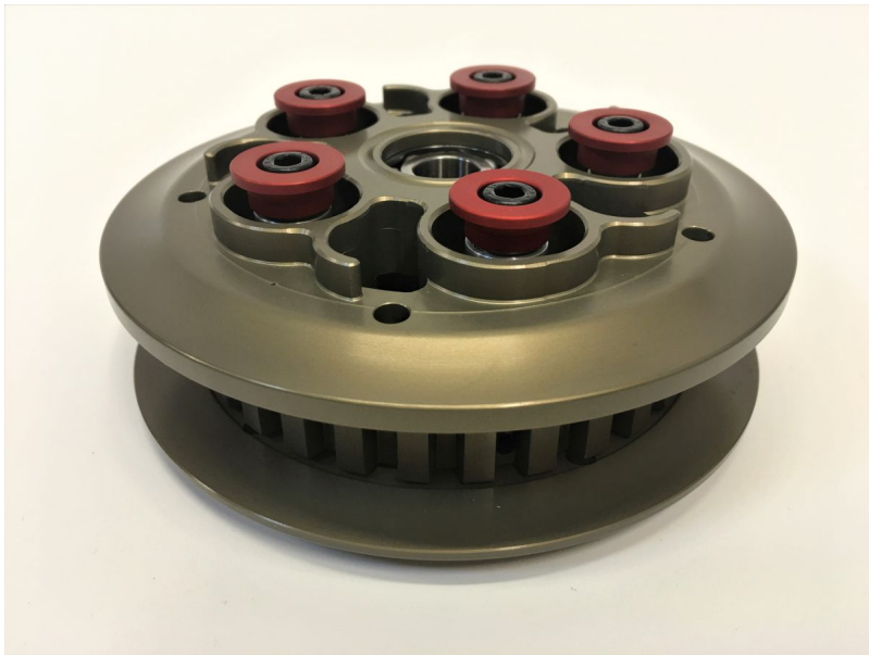
Slipper clutch for motorbike KAWASAKI NINJA 400 "R"