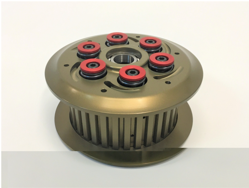
Slipper clutch for motorbike HONDA CBR1000RR 2020