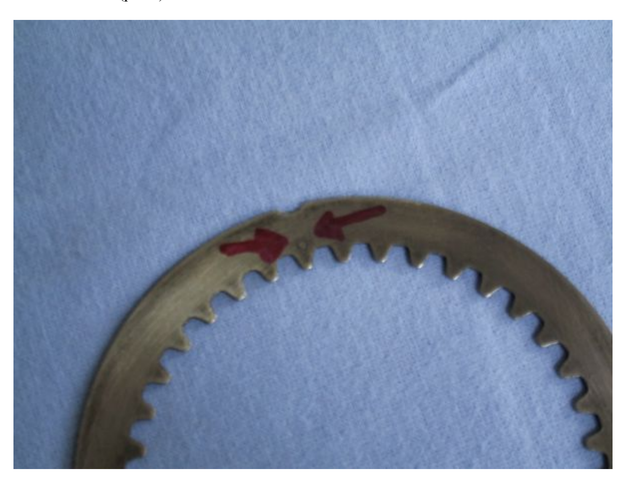
10901 Picture F (pic. f)