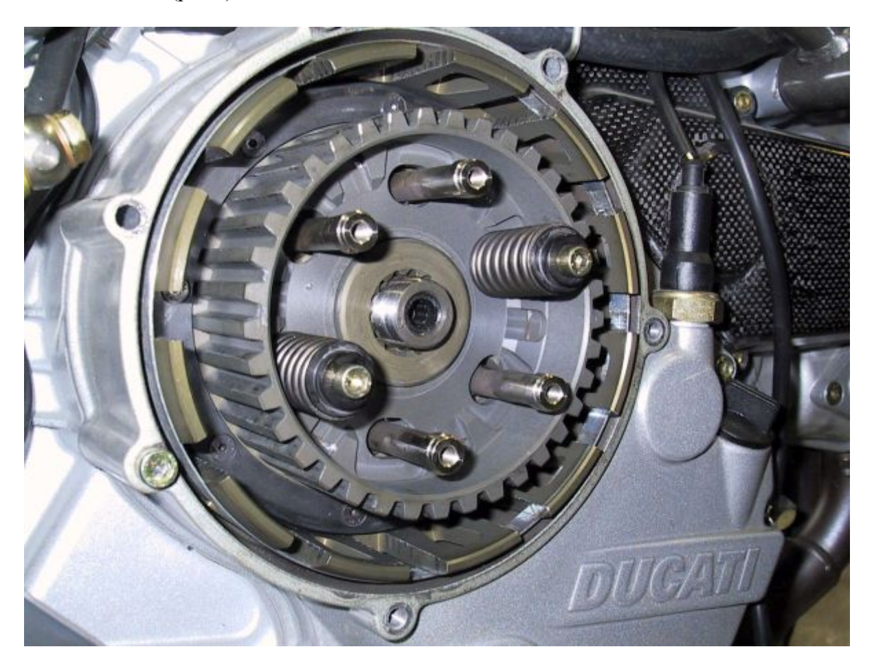
10901 Picture D (pic. d)