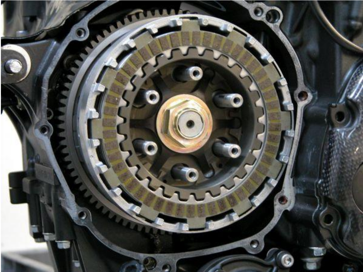
15703 Picture J (pic.j)