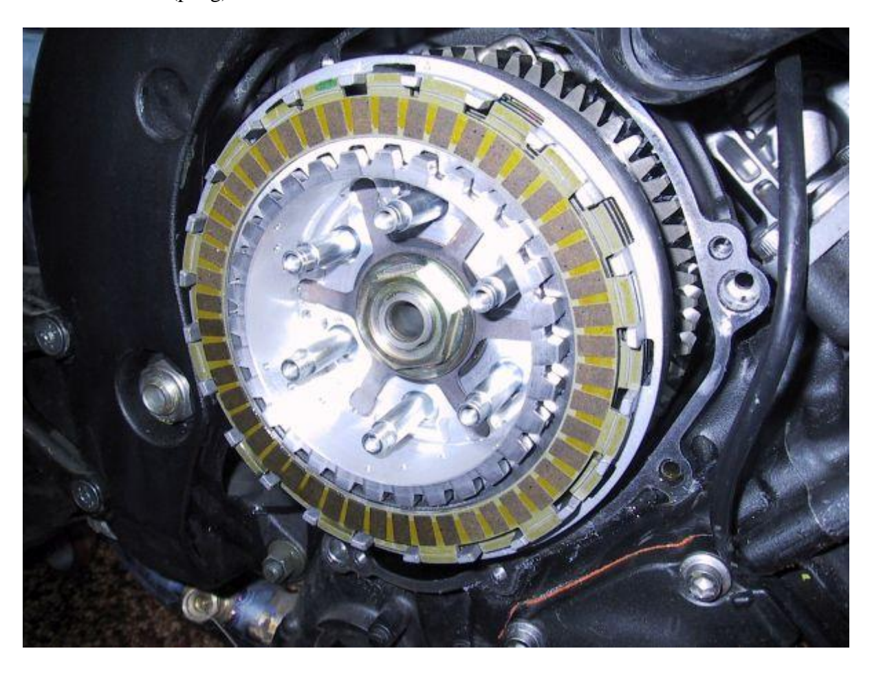
14503 Picture H (pic.h)