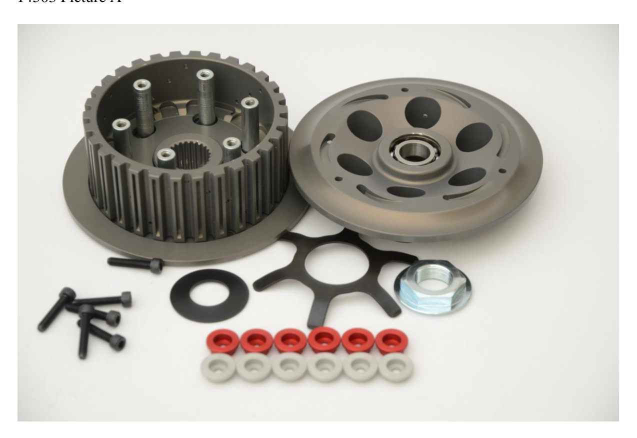
14503 Picture B (pic.b)