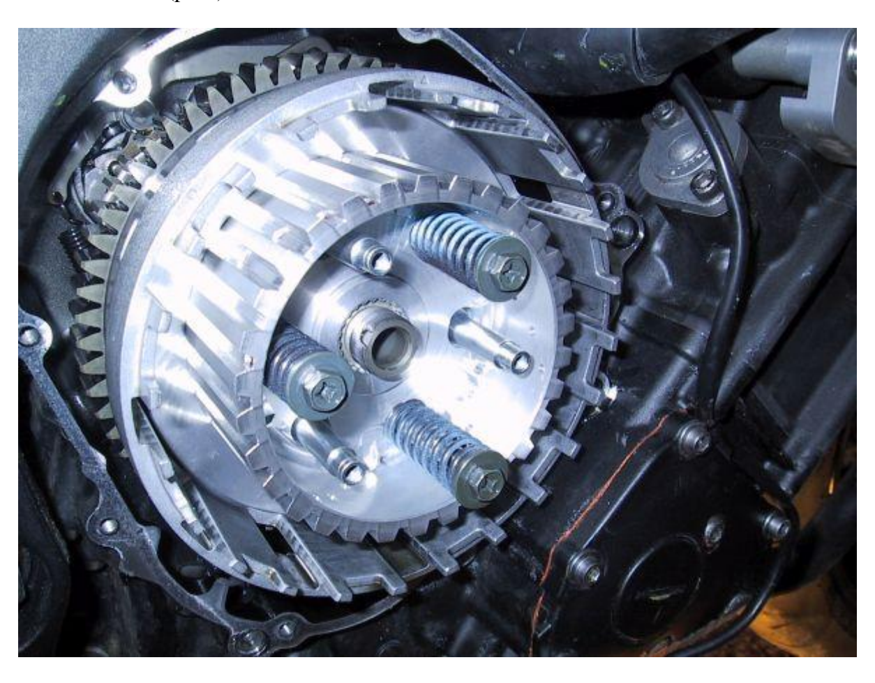
14503 Picture D (pic.d)