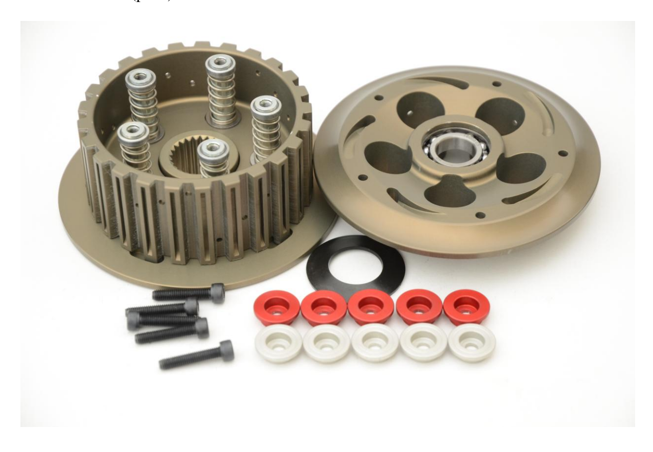
16203 Picture B (pic.b)