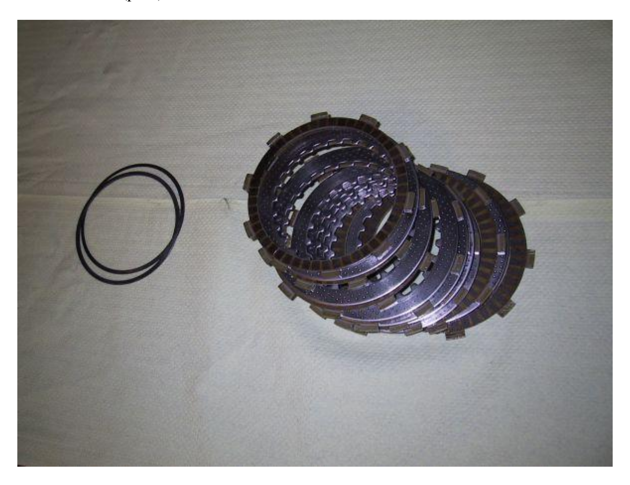
16203 Picture F (pic.f)