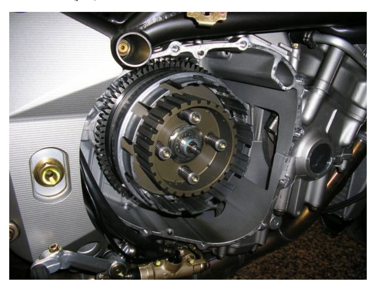
14703 Picture D (pic.d)