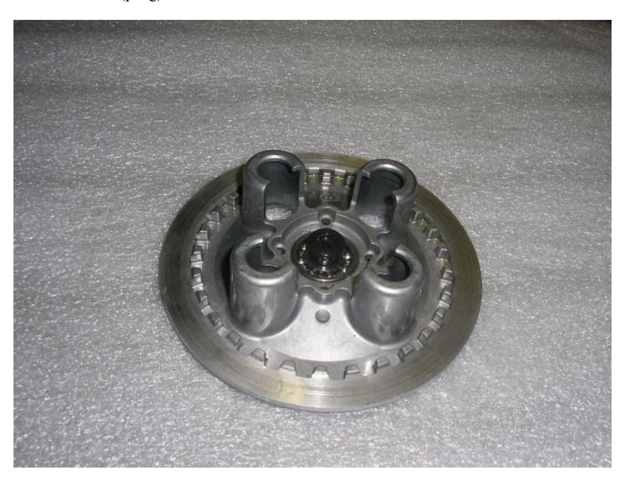
14703 Picture H (pic.h)