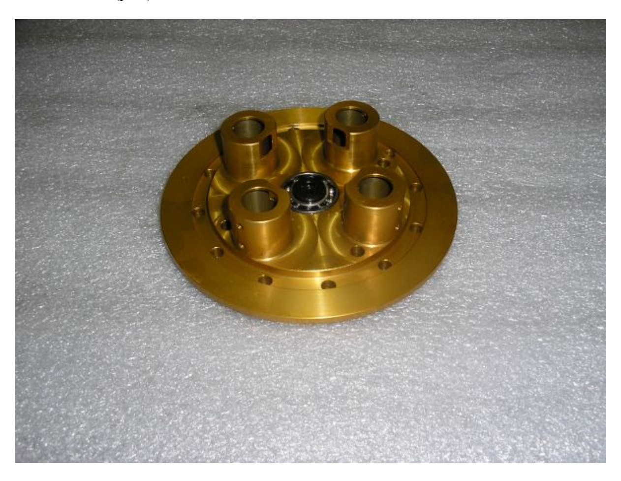
14703 Picture J (pic.j)