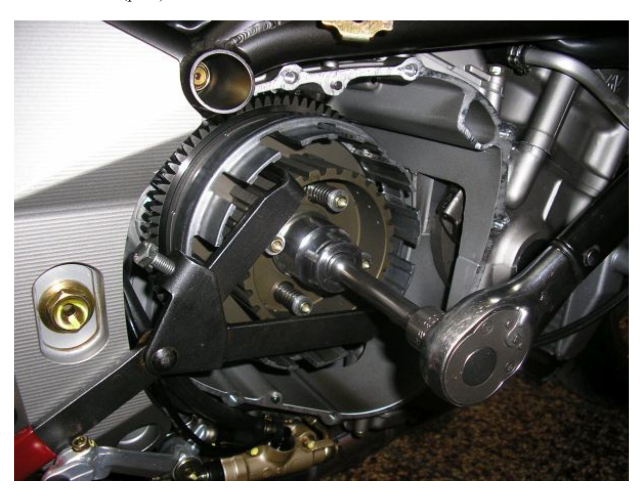
14703 Picture F (pic.f)