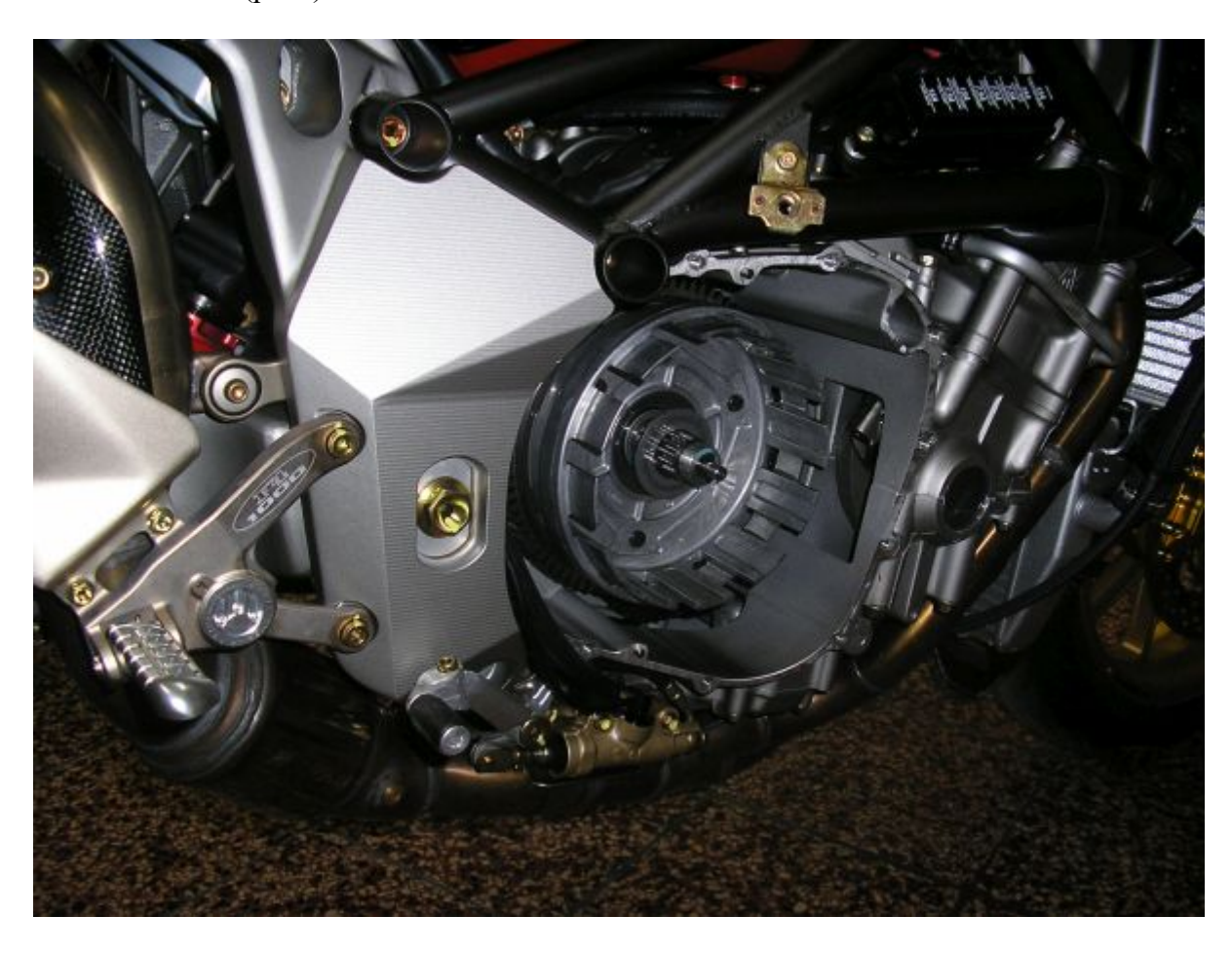
14703 Picture B (pic.b)