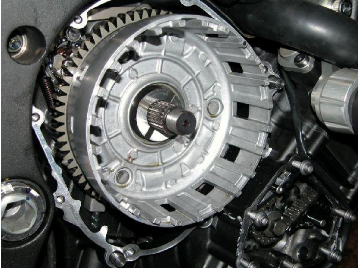
16803 Picture B (pic.b)