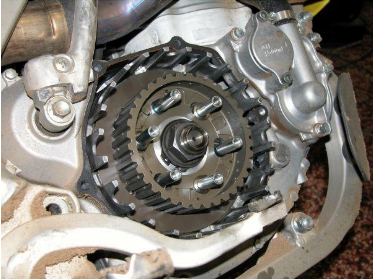
19803 Picture F (pic.f)