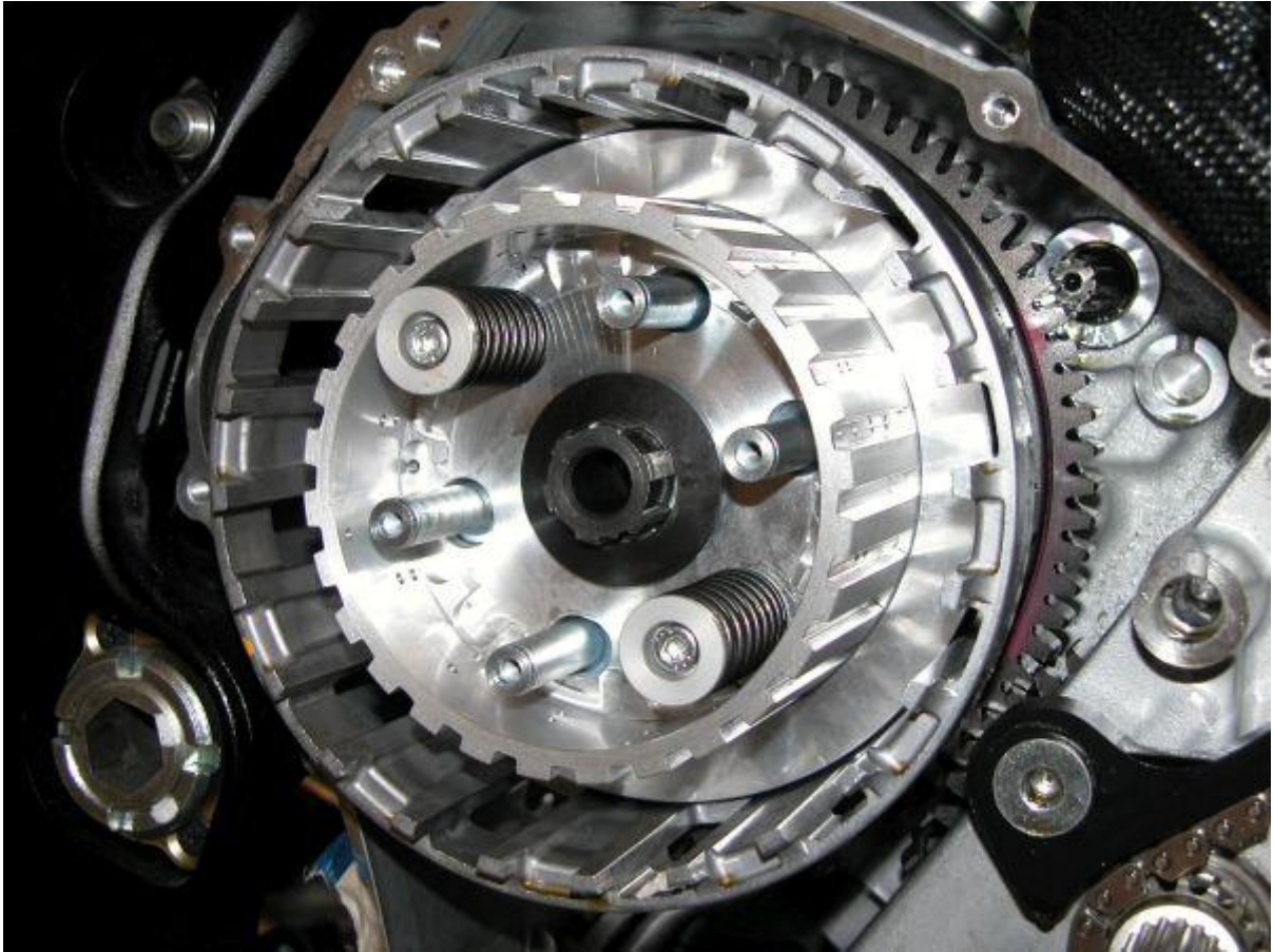
18203 Picture D (pic.d)