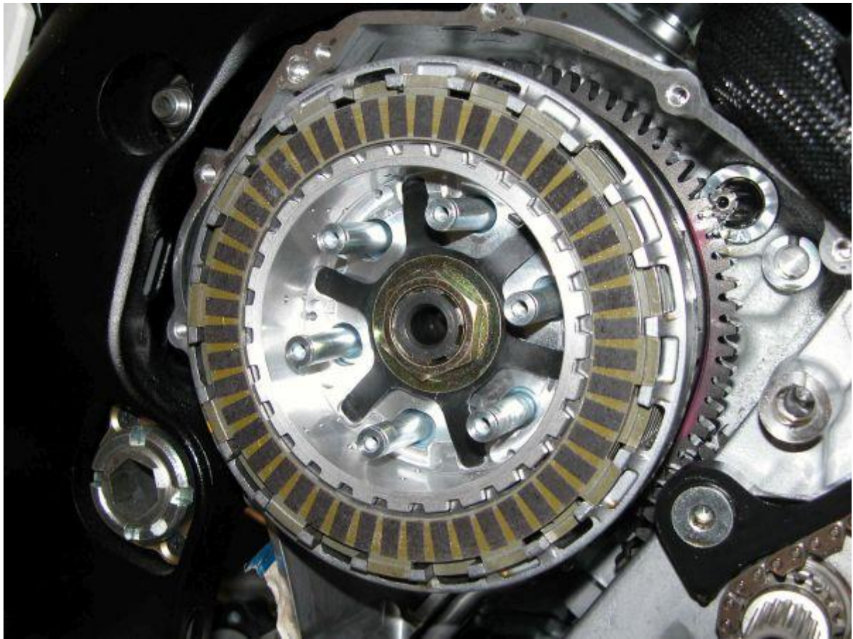
18203 Picture H (pic.h)