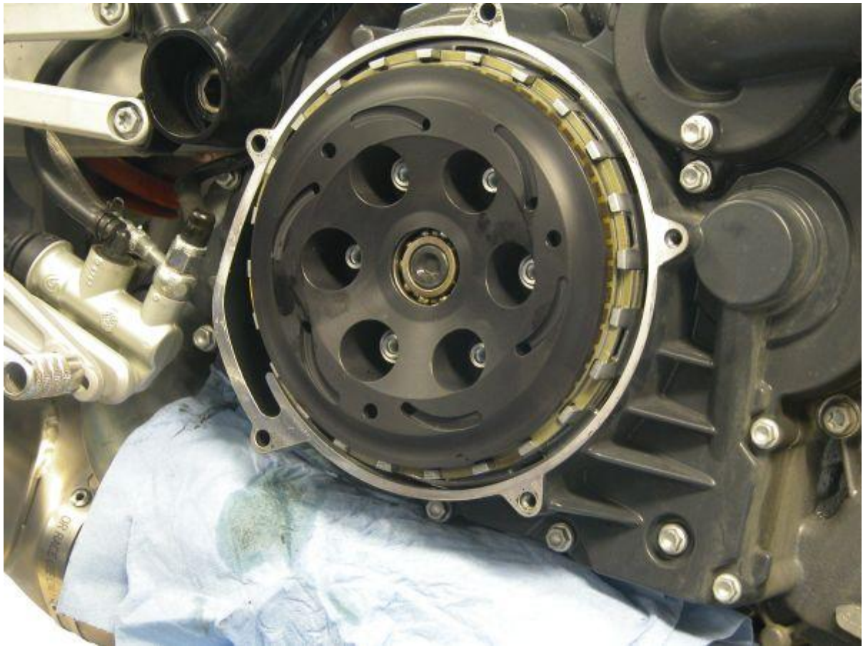
17903 Picture J (pic.j)