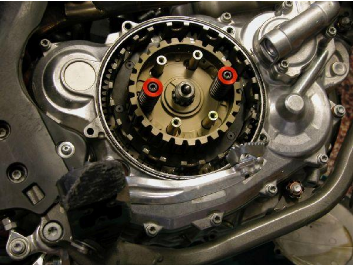
21403 Picture D (pic.d)