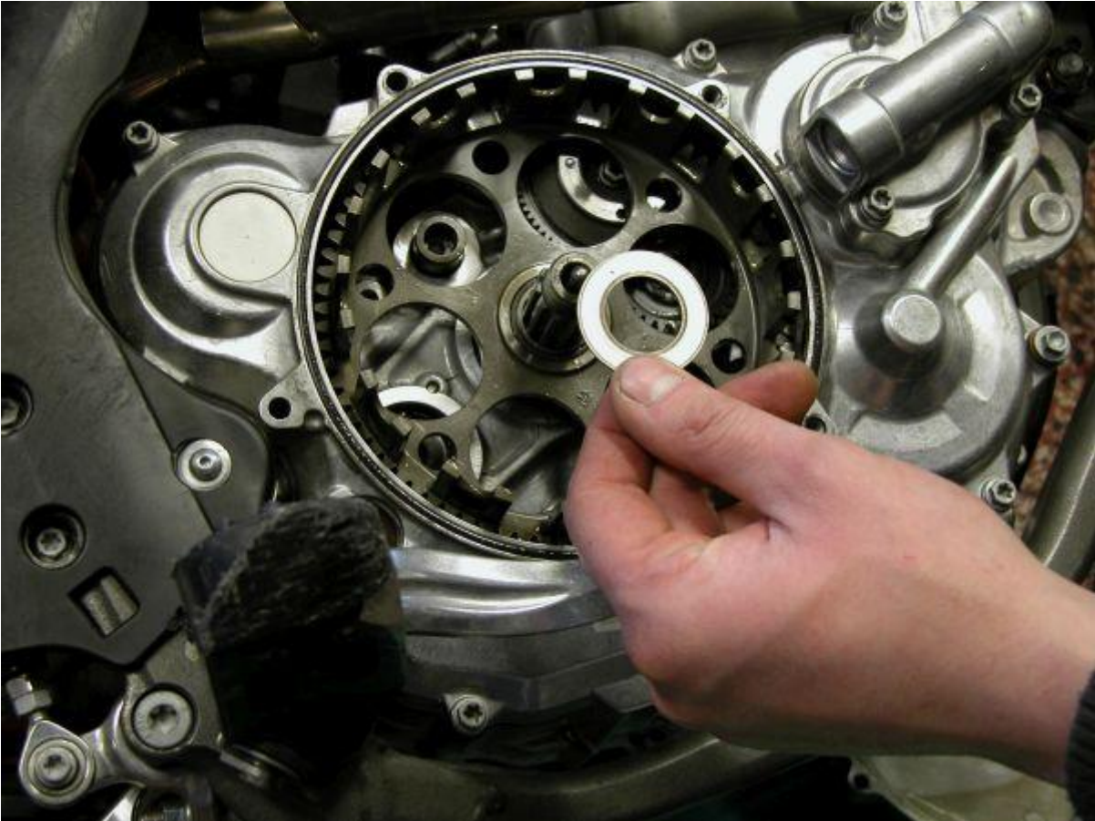
21403 Picture B (pic.b)