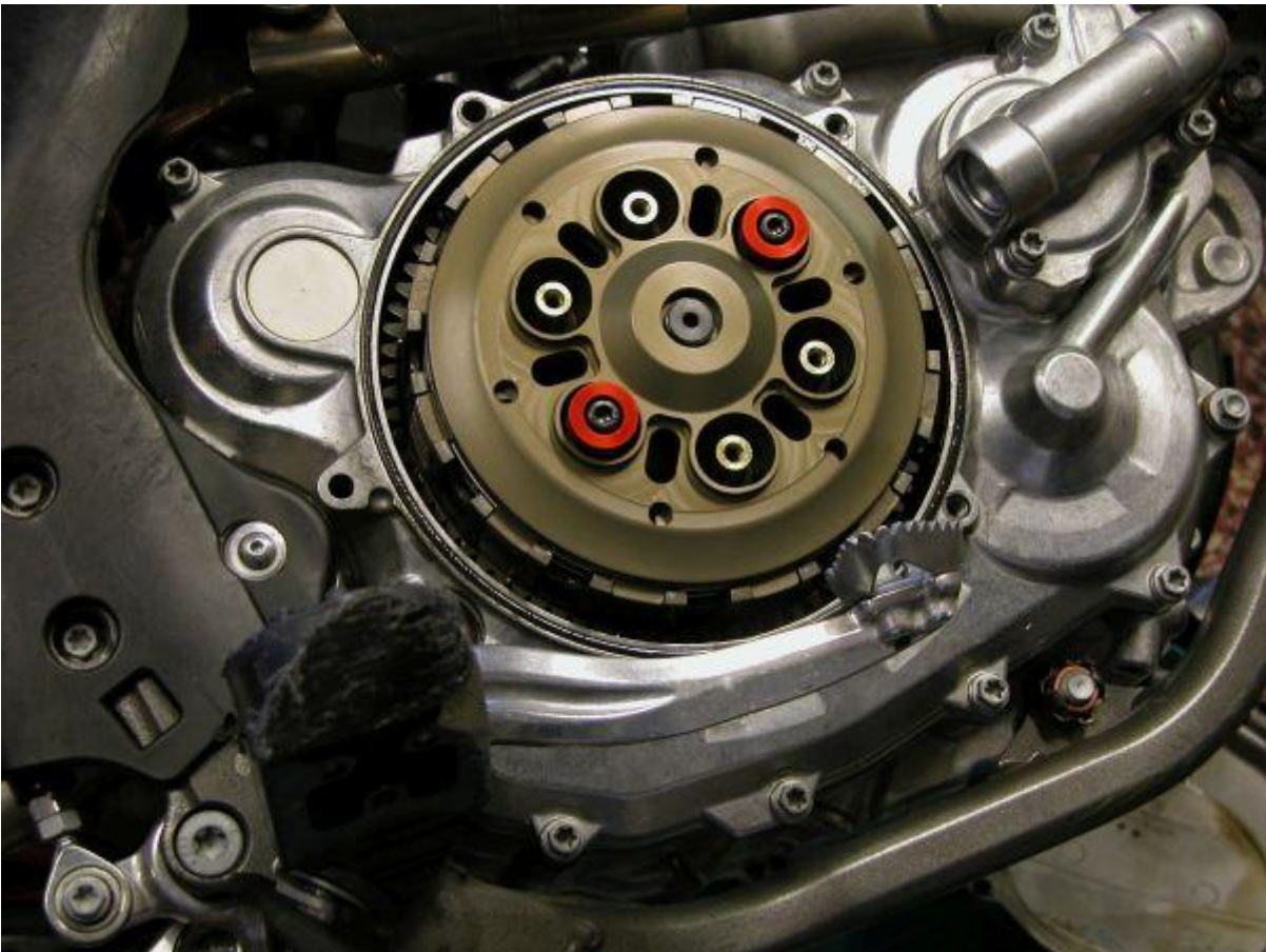
21403 Picture N (pic.n)