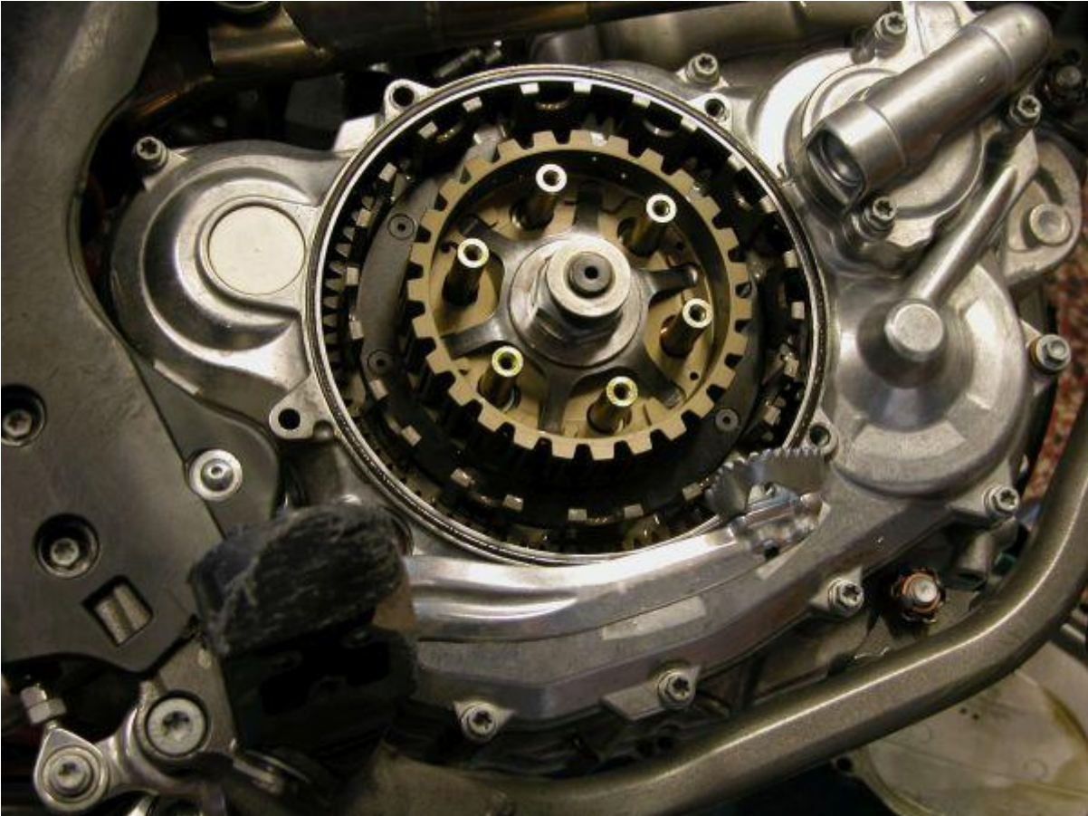
21403 Picture J (pic.j)