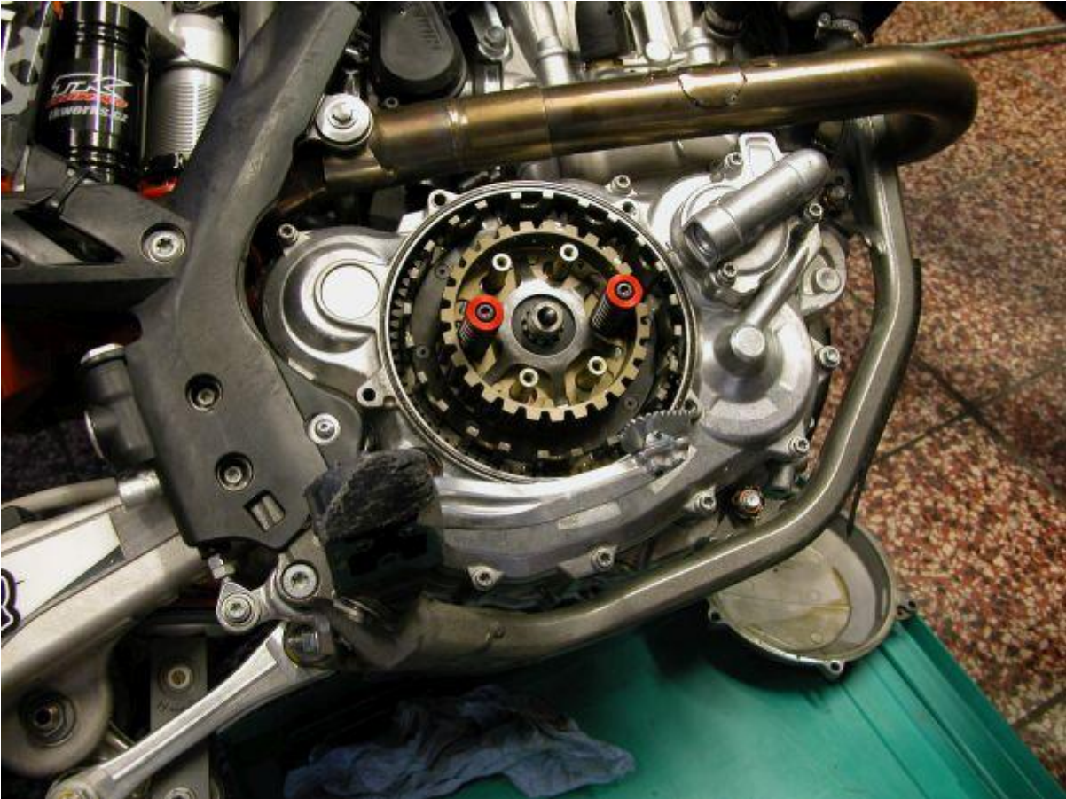
21403 Picture F (pic.f)